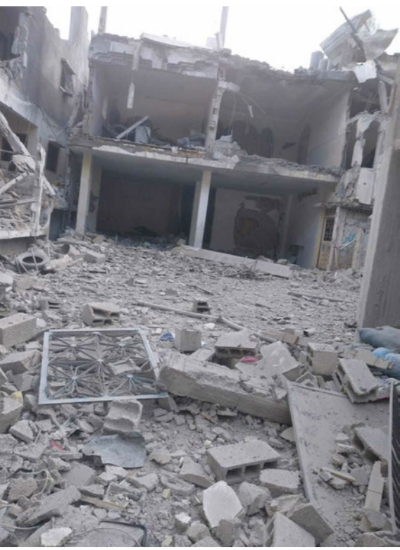
(Left): A pre-October 7, 2023 photo of Ghazal, a 14-year-old girl with cerebral palsy. © Hala Al-Ghoula. (Right): The remains of the Al-Ghoula family home in Gaza City after it was destroyed in an Israeli airstrike on October 11, 2023. © 2024 Hala Al-Ghoula